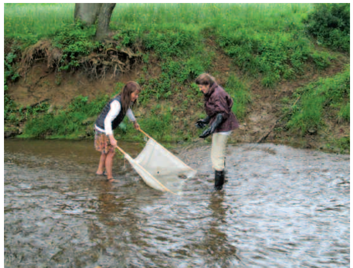
Monitoring Crooked Run