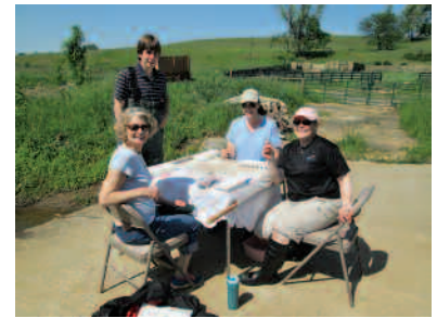
Dolphin Quest team monitors