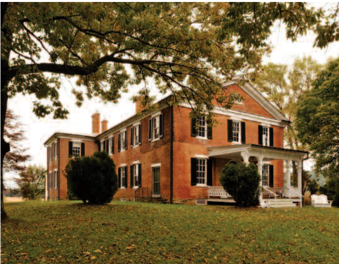
Site of our Annual Party held at historic Waveland