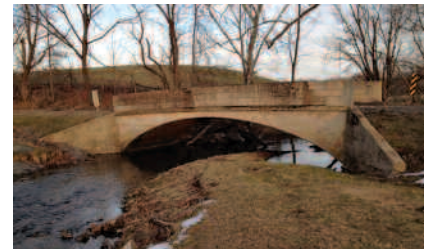
Luten designed bridge over Pantherskin Creek