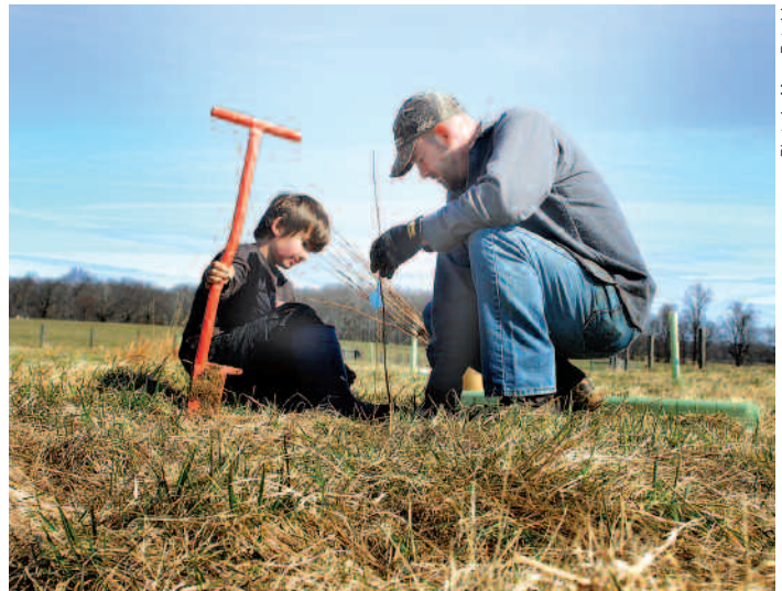
GC watershed tree planting on a local farm