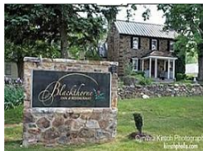
Blackthorne Inn Development