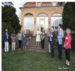
GCA Board Members & Staff