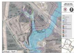
True North Data Center