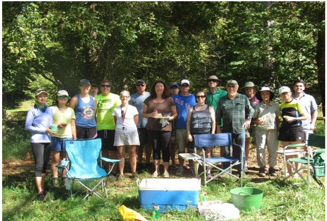
2017 Goose Creek Canoe Clean-Up

Join us for our Annual Meeting on June 12, 2018 Tri-County Feeds Community Room - 4:00-6:00 pm